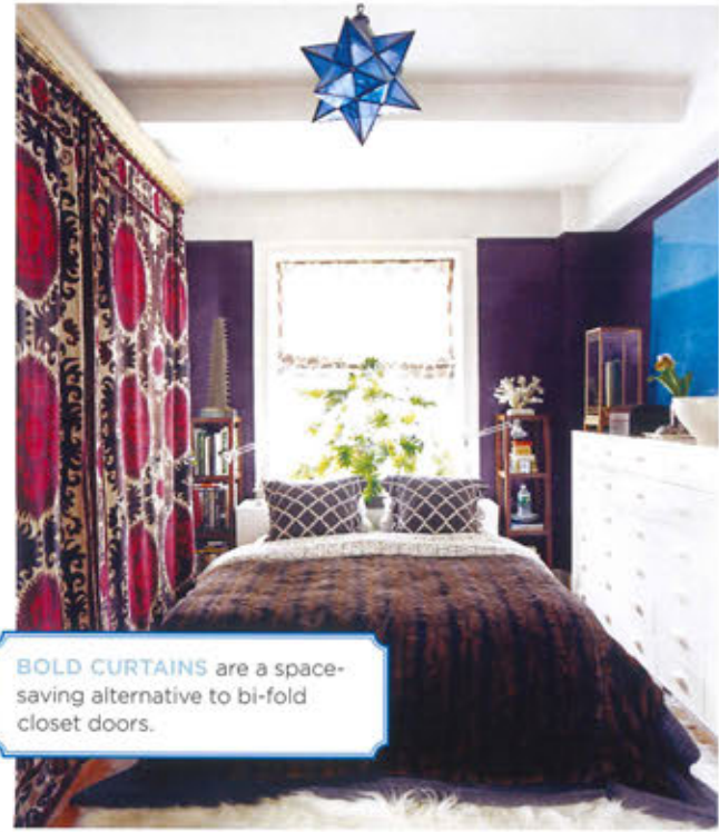
BOLD CURTAINS are a space-saving alternative to bi-fold closet doors.