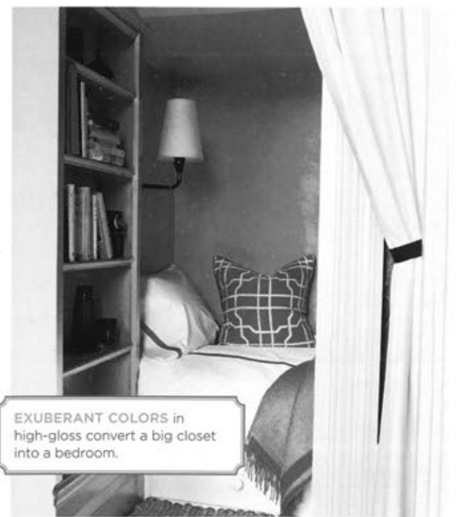
EXUBERANT COLORS in high-gloss convert a big closet into a bedroom.