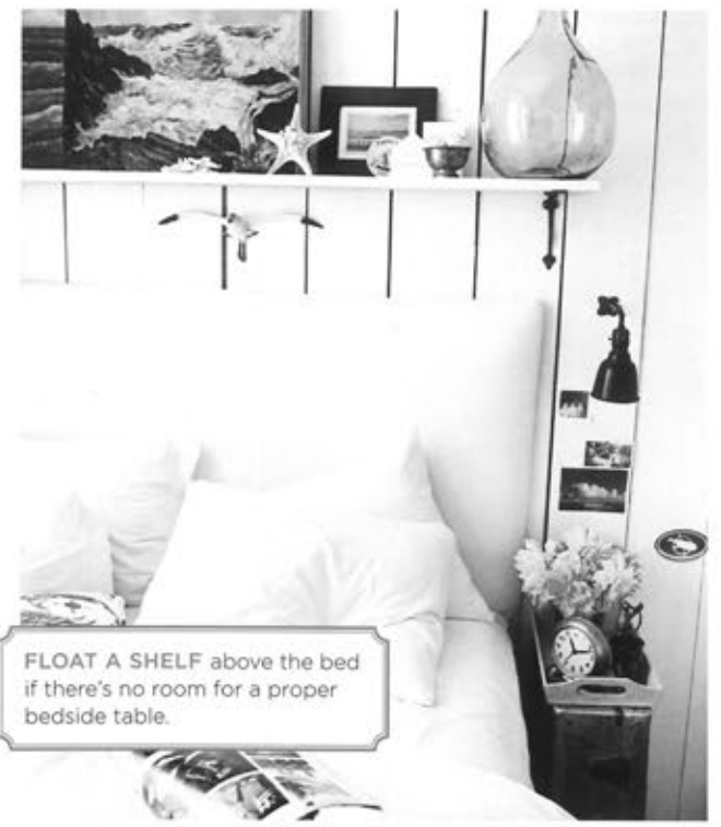
FLOAT A SHELF above the bed if there's no room for a proper bedside table.