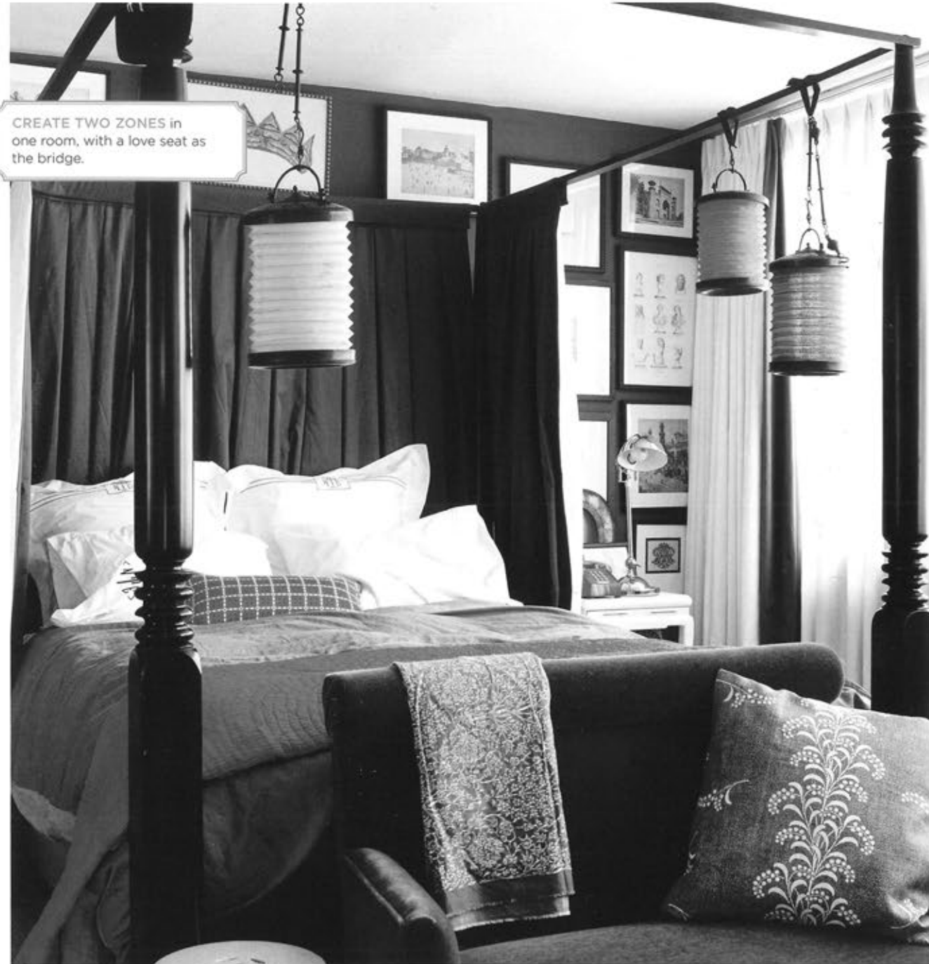
CREATE TWO ZONES in one room, with a love seat as the bridge.