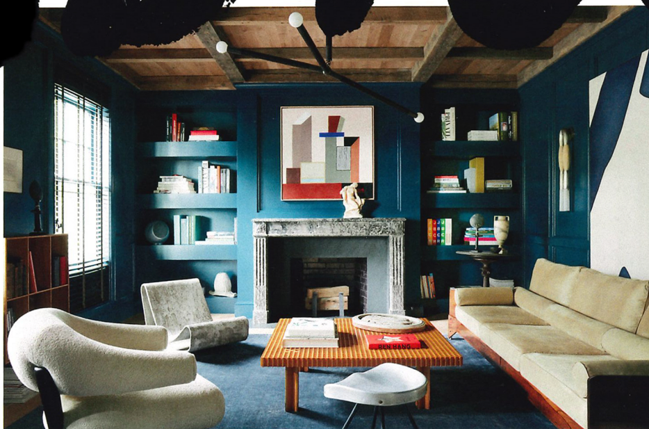
A RHODE ISLAND LIBRARY DESIGNED BY GIANCARLO VALLE.