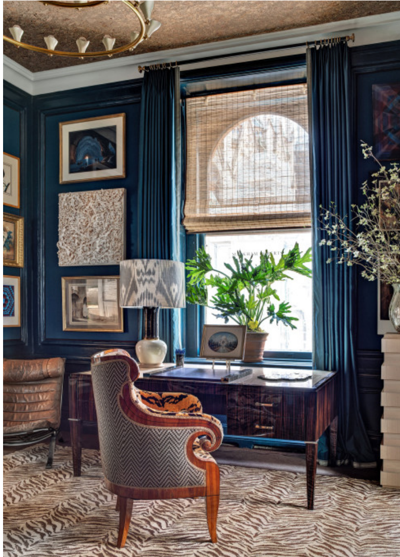
Kips Bay Show house – study by Markham