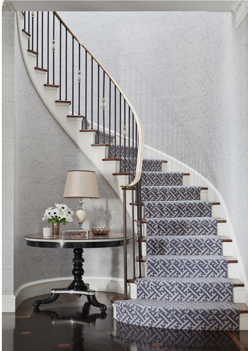
New York Stair hall

Seriously I suppose acres of land to preserve. Or if the question were "could never have too much", the answer would be long-term friends to count on. I was going to say loved pets, but that might be too close to a crazy cat lady answer.