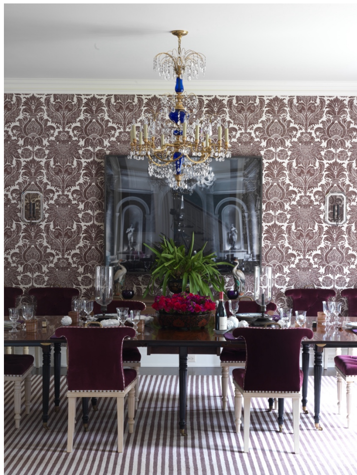
Indiana Dining Room