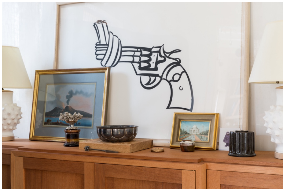
Conference room with pictures of Indian miniatures and Vesuvius gouaches