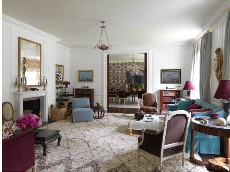
Indiana Living Room