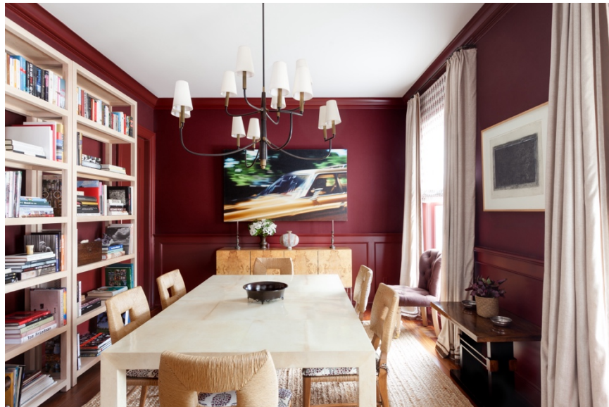
Southampton Dining Room