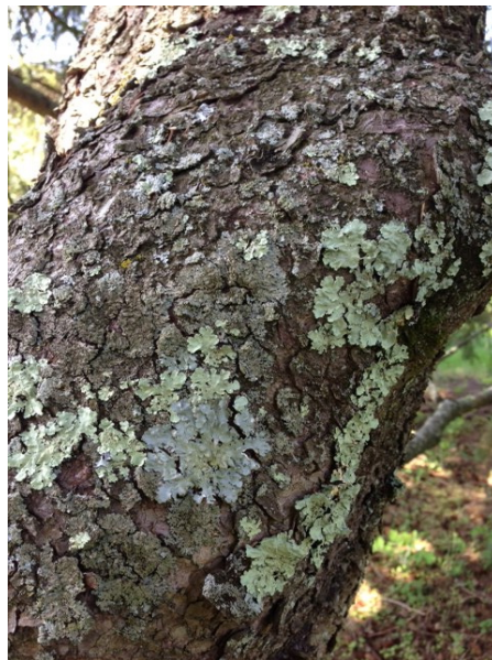
Moss on a tree