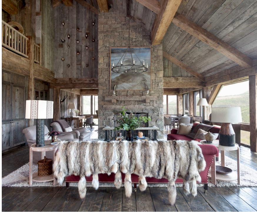
Montana Living Room