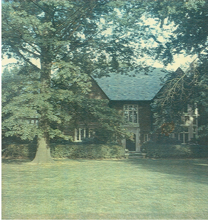
Meridian Street Roberts House