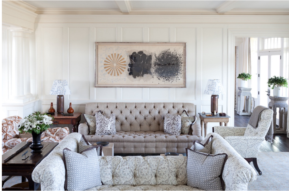
Quogue Living Room