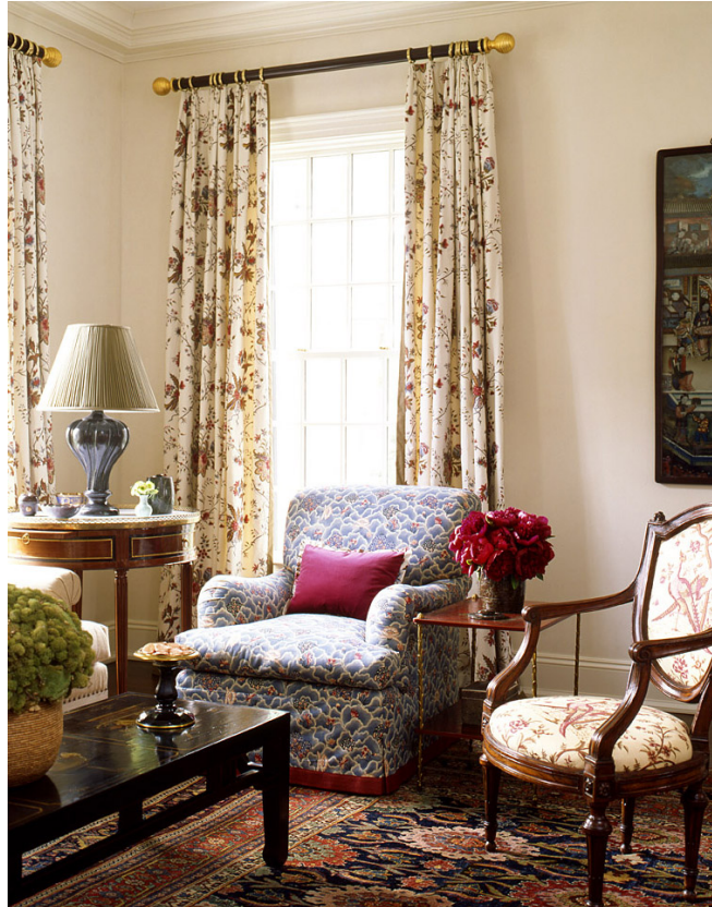
Greenwich Living Room