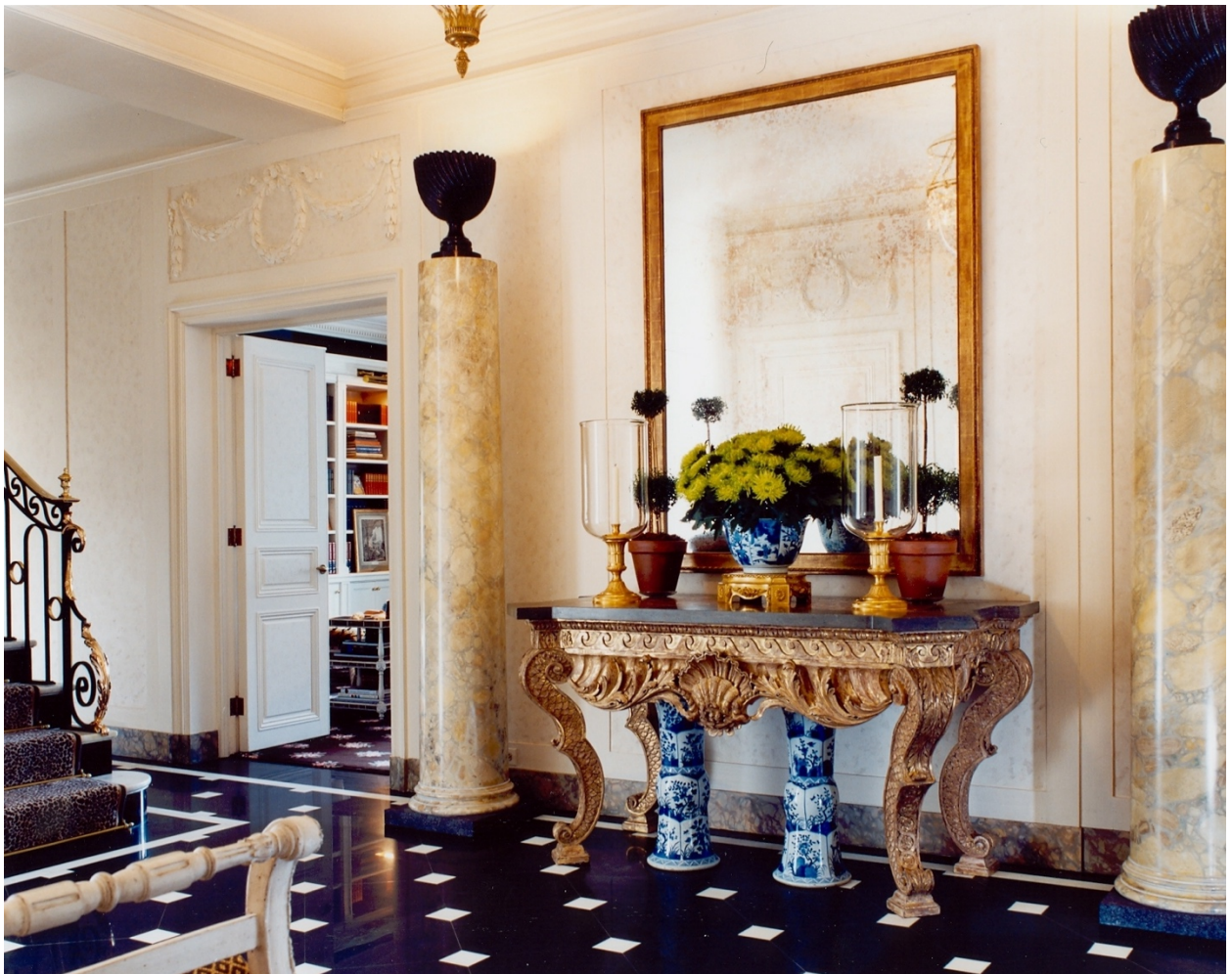
New York City Hall- one of my favorite rooms of all time!

Adaptable and practical sounds completely boring, but it's the underlying theme or strategy in my approach to decorating. On top of that, I try to finish rooms in a sophisticated, layered way that reflects the clients and suits their needs.