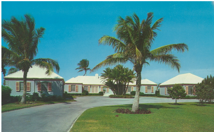
Naples – Surf Song