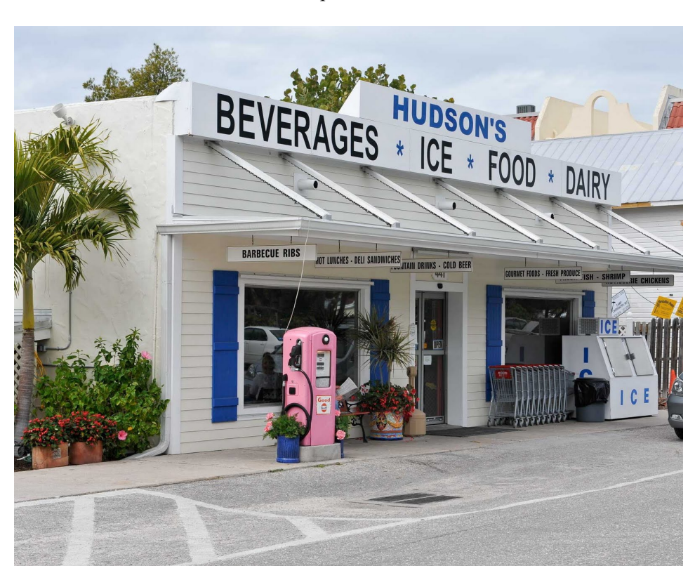
Hudson's Boca Grande