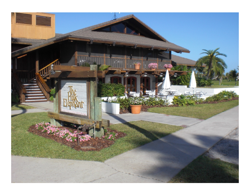
The Pink Elephant