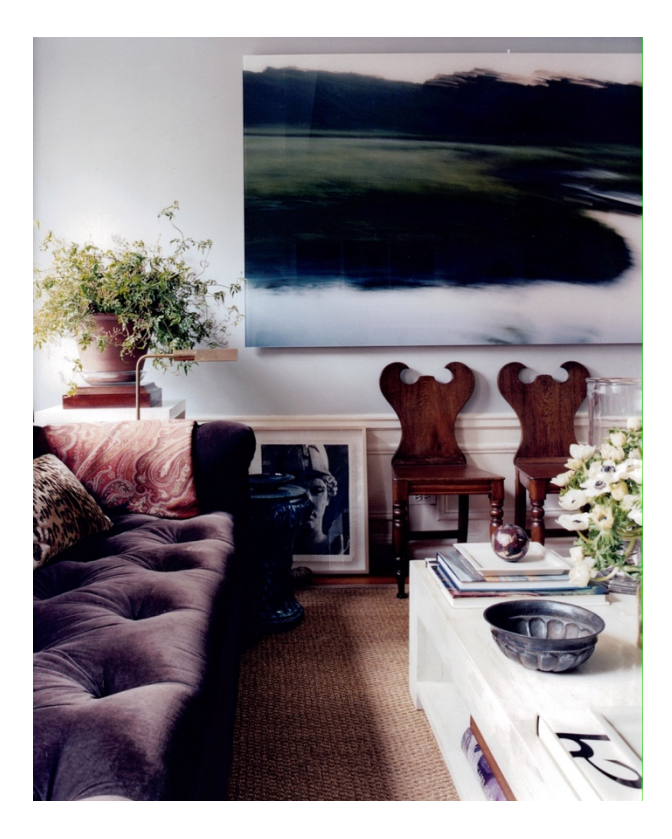
Markham's living room with chocolate brown sofa