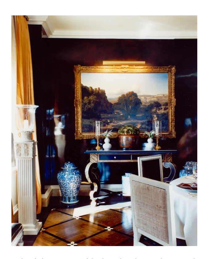
New York Dining Room with chocolate brown lacquered walls